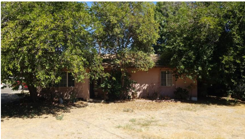
Residence 2 Overview

Integrity. As the building remains in its original position and is still in use as a residential property, it retains integrity of location, setting, and association. Alterations have diminished integrity of design, materials, workmanship, and feeling.