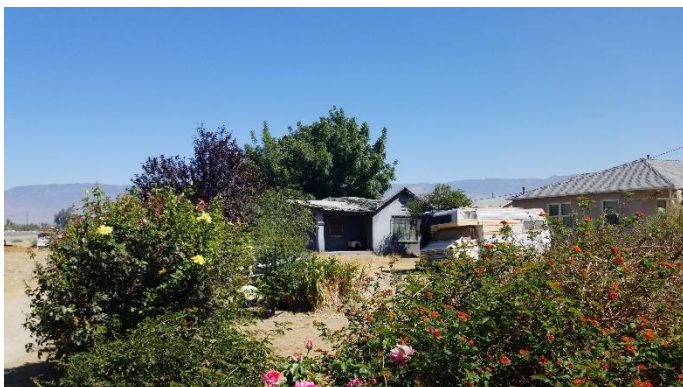
Back House Overview

Integrity. As the buildings remain in their original positions and are still in use as residences, they retain integrity of location, setting, and association. Alterations have diminished integrity of design, materials, workmanship, and feeling.